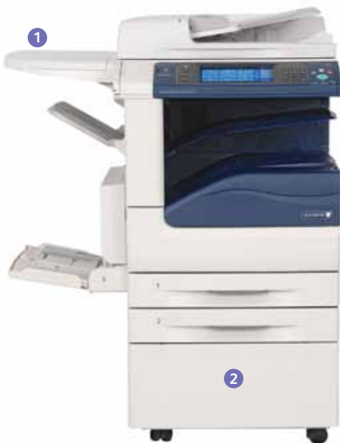
1 Optional Wing Table