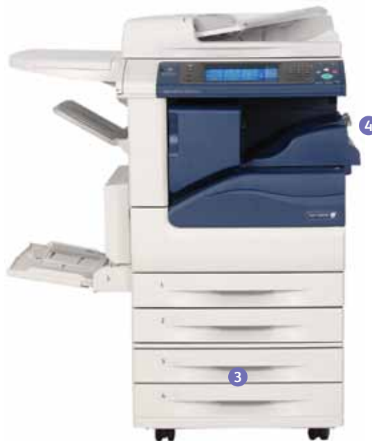
3 Four 500-sheet paper trays adjustable up to A3