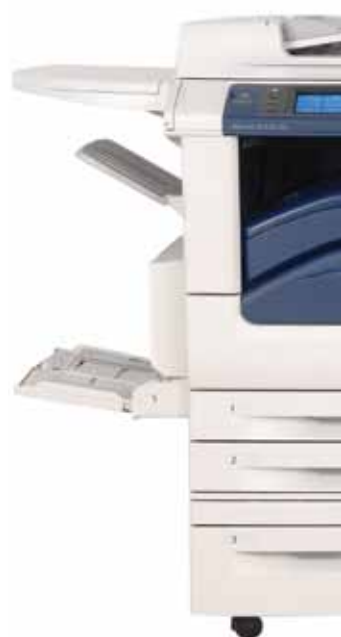
4 Optional integrated stapler finisher